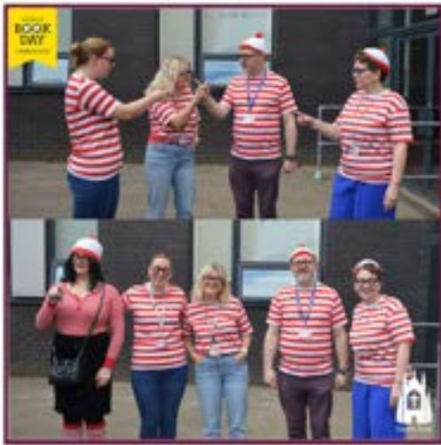
Thank you to the teachers who dressed up for World Book Day!